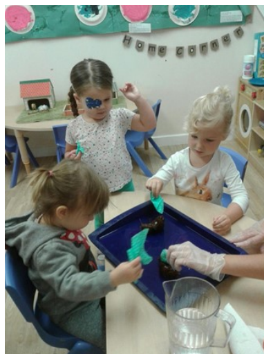
Cleaning the snails