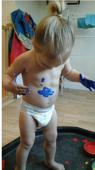
Enjoying body painting.