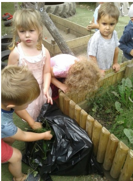
Digging up the weeds