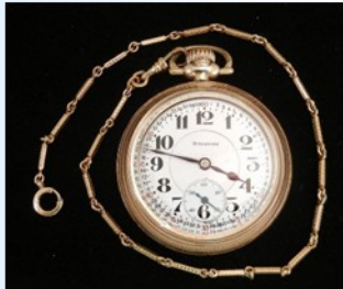
Long Service Rewards