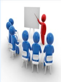
Staff Training Facility